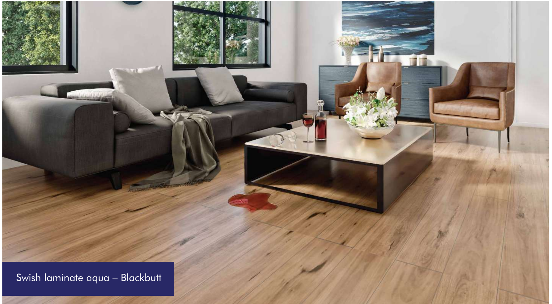
Swish laminate aqua – Blackbutt