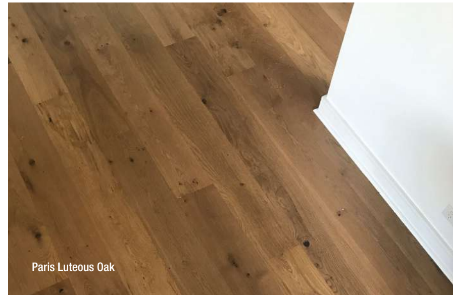
Paris Luteous Oak