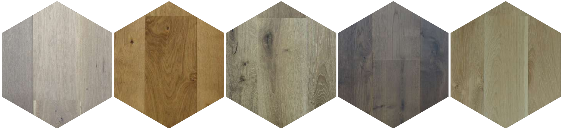
Elegant White Oak