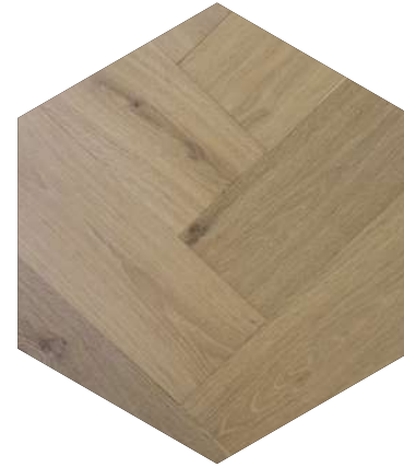
French Ghost Herringbone