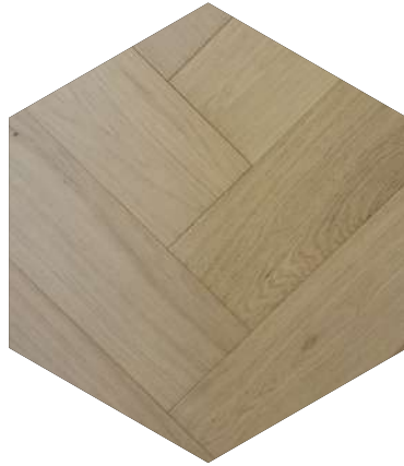
Danish White Herringbone