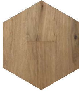
Oak Dove Grey