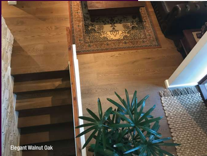
Elegant Walnut Oak