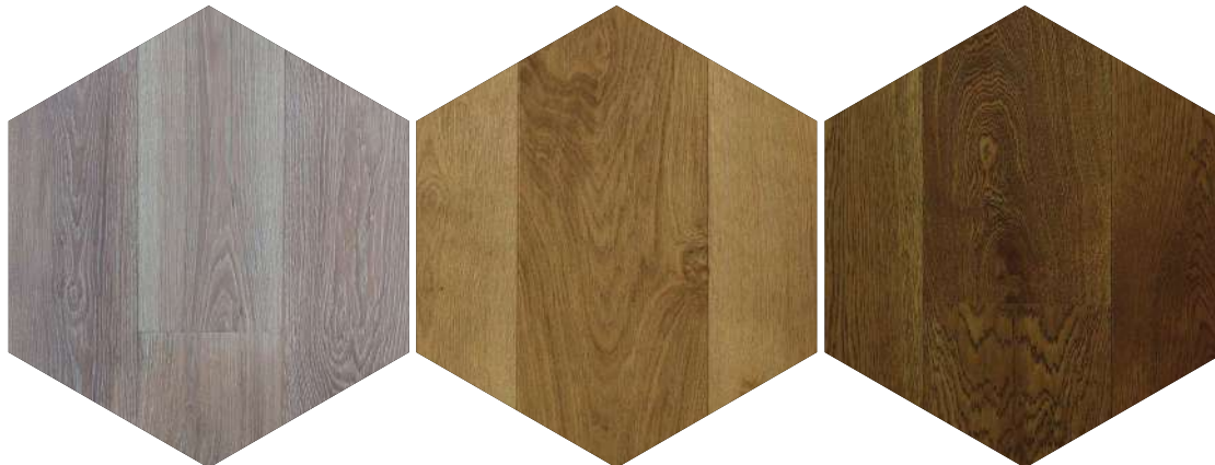
Elegant Milano Oak