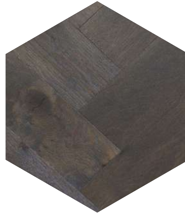
French Carbon Herringbone