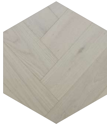
Ambient Sand Herringbone