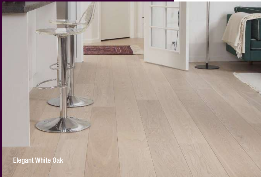
Elegant White Oak