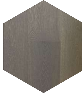
Oak Grey Harmony