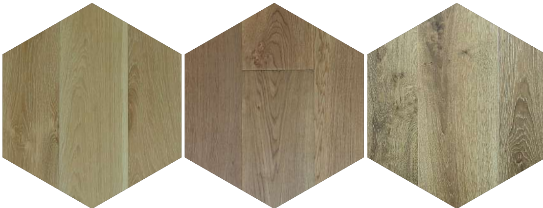
Limed Piccolo Oak