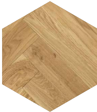
French Natural Herringbone