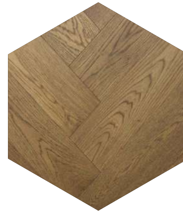
Fiona Brown Herringbone

Swish Oak Flooring is a beautifully crafted range of timeless French Oak. The signature palette of colours, natural grain characteristics, and finishes have been prudently designed capturing timeless elegance, the essence of Oak flooring.