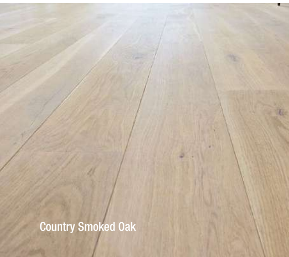
Country Smoked Oak